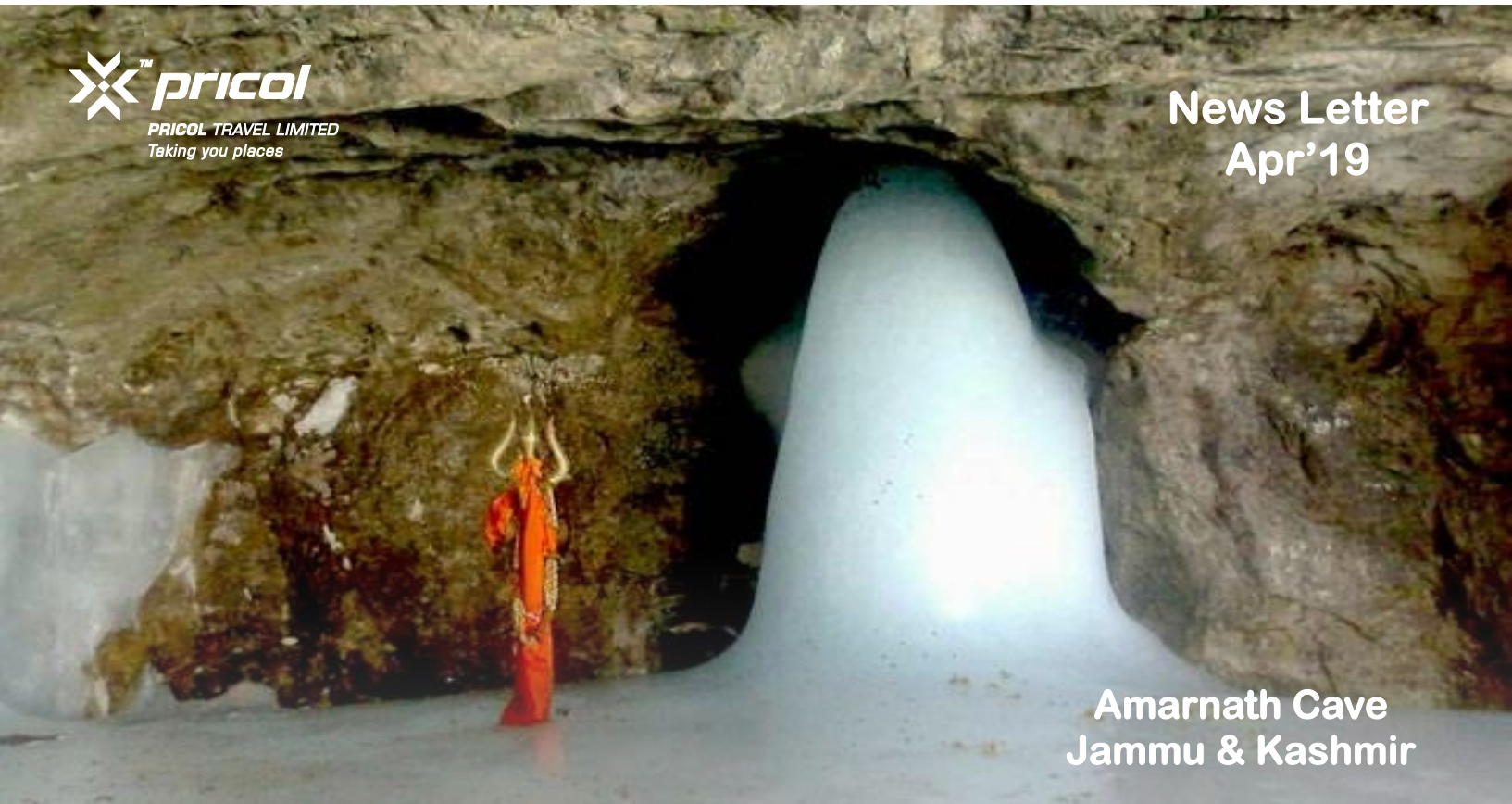
Amarnath Cave Jammu & Kashmir

About Amarnath Caves: Located at a breathtaking altitude of 3,888 meters, Amarnath cave is a prominent pilgrimage as well as a major tourist attraction in India. Dedicated to lord Shiva, the cave is spread over one km square and has a natural ice stalagmite Shiva lingam